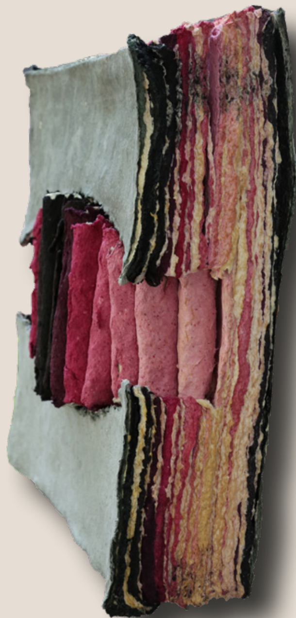
The Shape of hiddenness NO.3