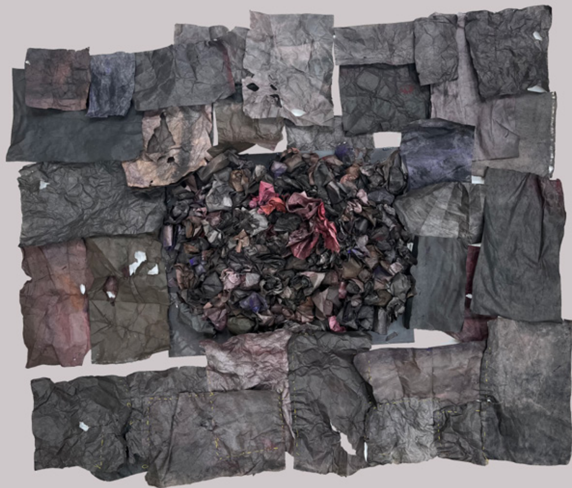
另一种时间之二 100x120cm 宣纸综合材料 2023