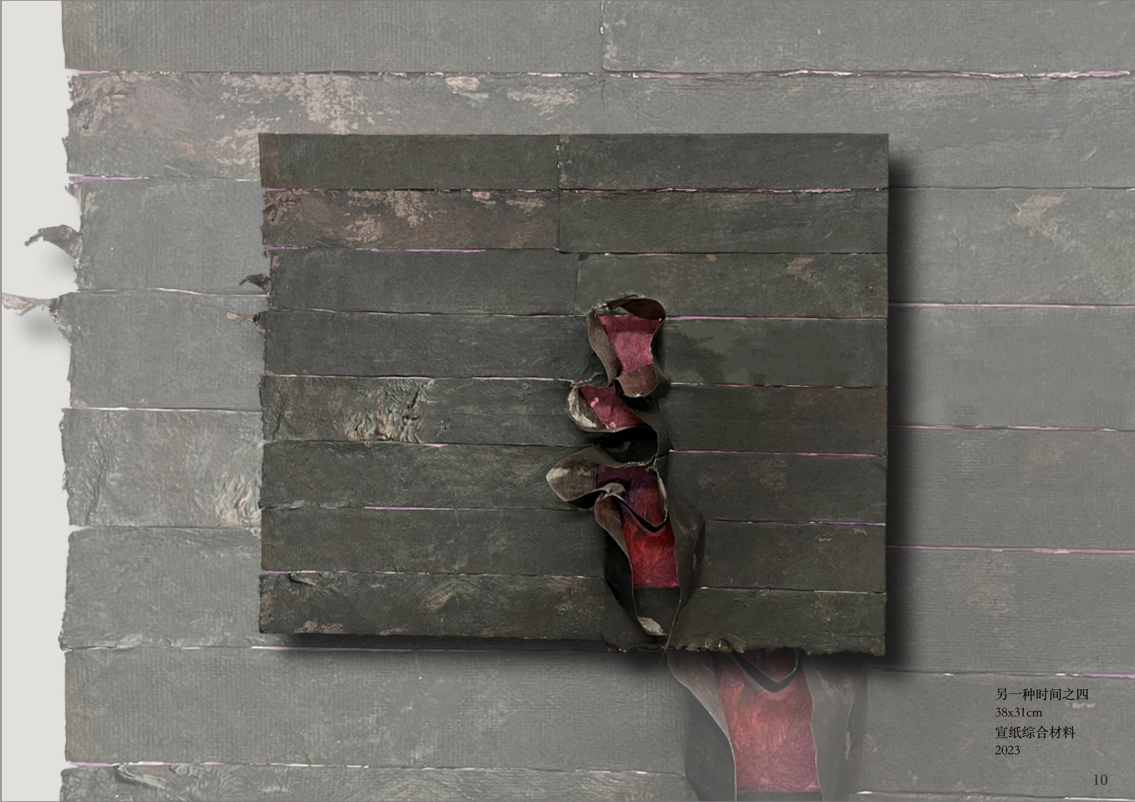
另一种时间之四 38x31cm 宣纸综合材料 2023