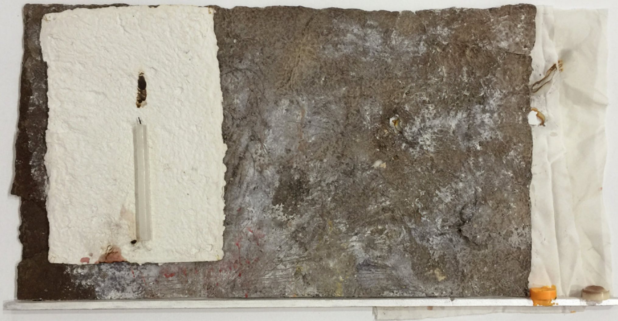
时间告诉我疼痛的样子 47x88cm 纸浆综合材料 2 016