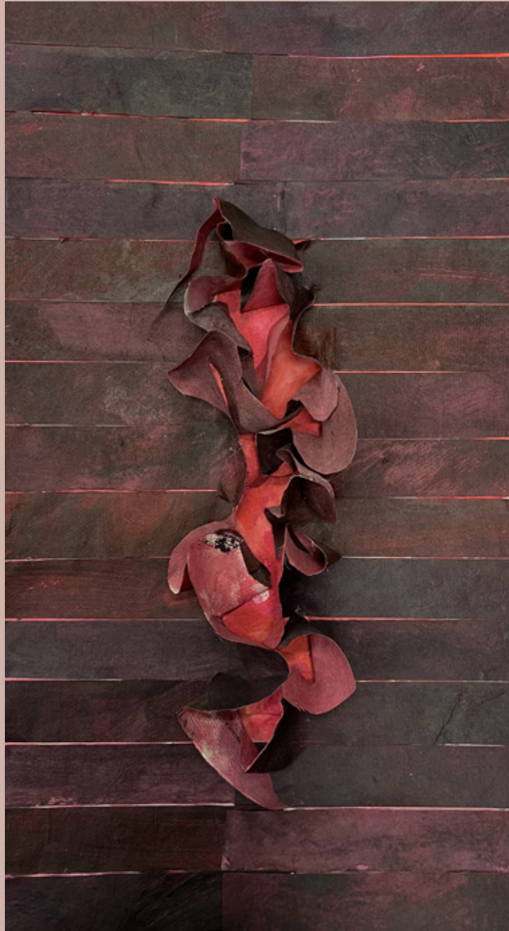
另一种时间之三 49x28cm 宣纸综合材料 2023