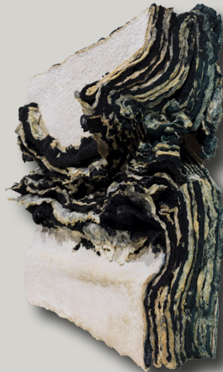
The Shape of hiddenness NO.3