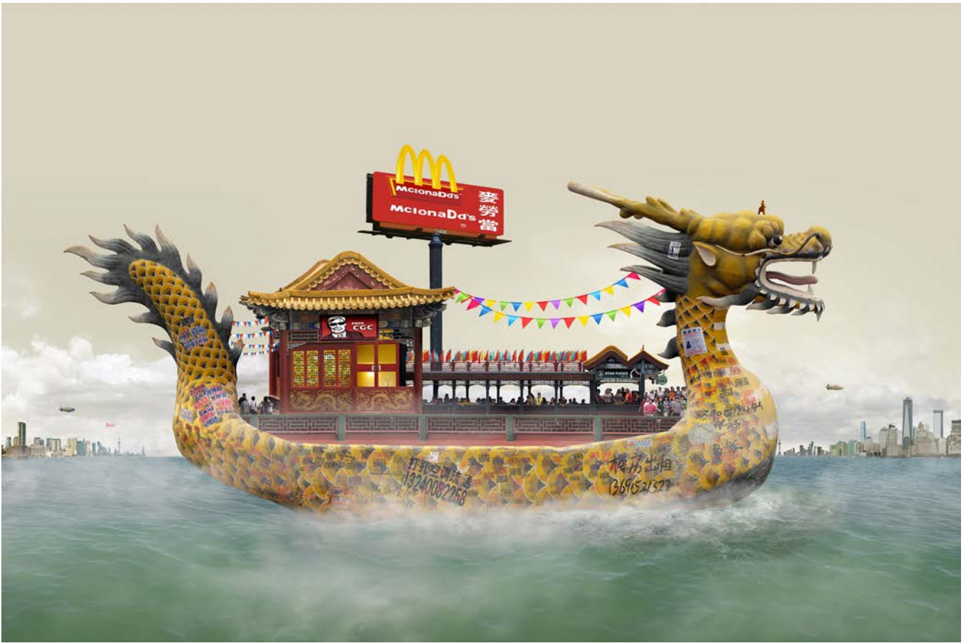
Seaside No. 1 海国图志之一, Epson Ultra Giclee, 100 x 150 cm, 2014