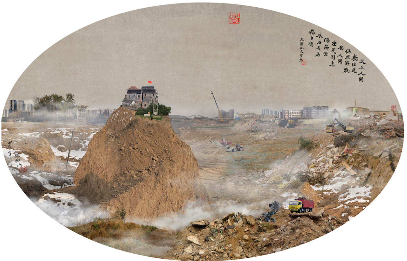
Heaven on Earth No. 2 新山水之天上人间之二, Epson Ultra Giclee, 100 x 150, 2014

Yao's works seem harmonious from far, but a closer look reveals depiction of contemporary issues artist has been tackling in his artworks. He evokes tradition in his landscapes, but simultaneously activates the dialogue between the tradition and present that both become the subject of development and preservation. Ancient paintings recall a peaceful and poetic atmosphere with a Utopian ideal, while his "landscape" adds a contemporary touch dealing with the problems of the pollution, consumerism,