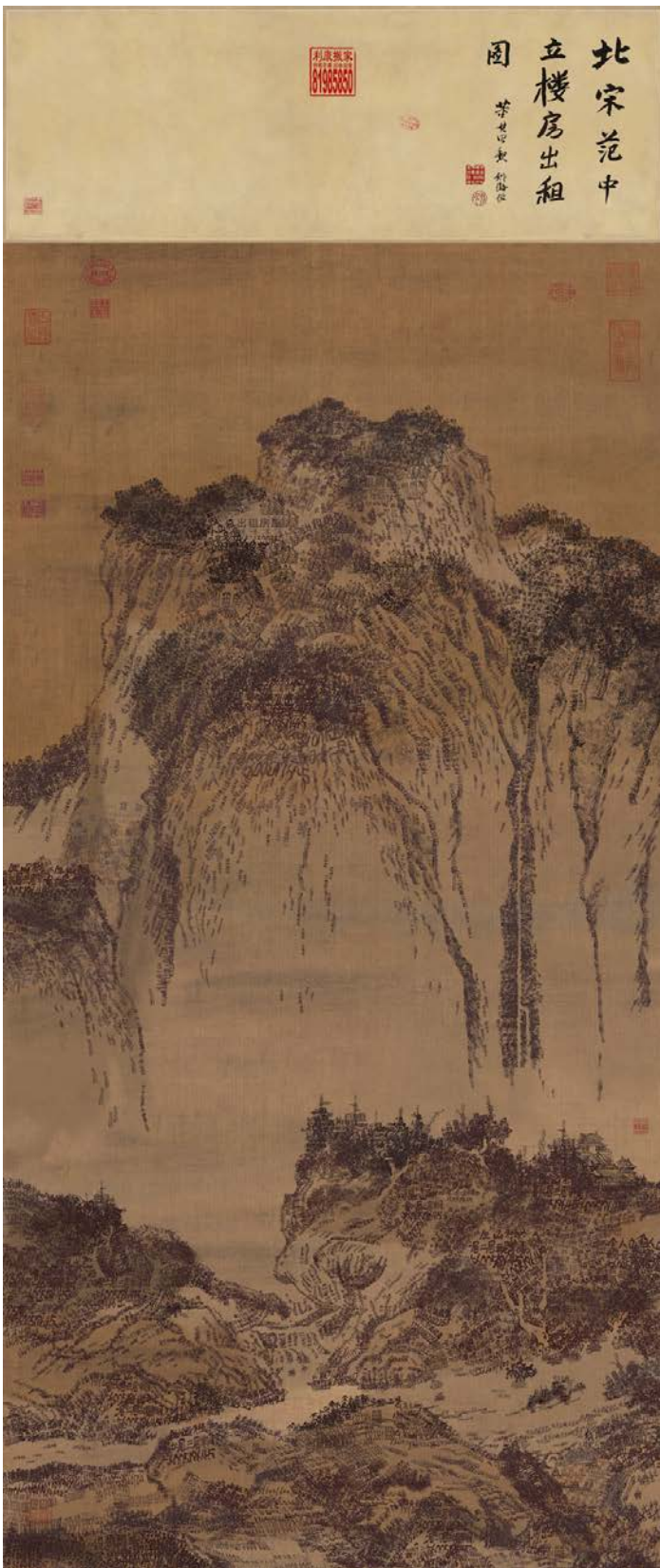
House Leasing 房租出租图, 250 x 100, 2016