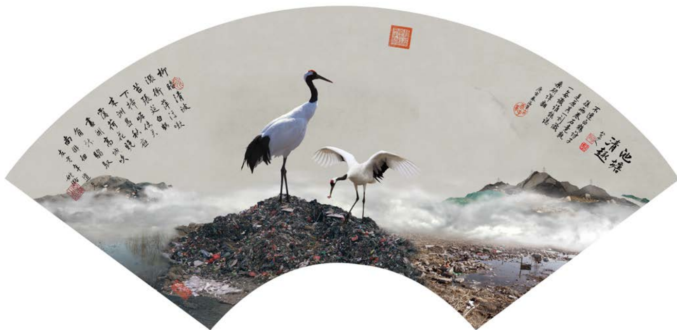
Cranes Squawking on the Deserted Hill 孤山鸣鹤图, C-Print, 113 x 60 cm, 2010