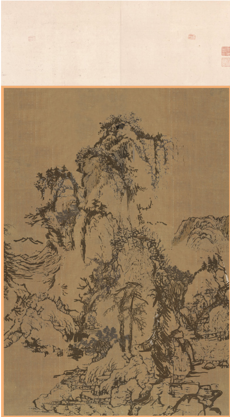
Early Spring, 早春图, 200 x 100 cm, 2016