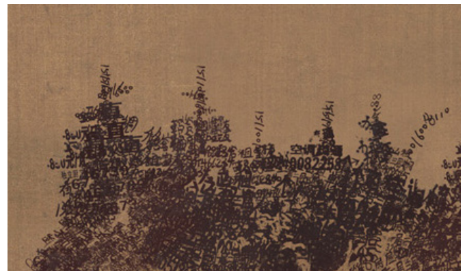
House Leasing 房租出租图. details 局部