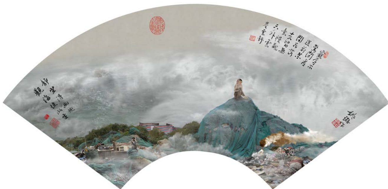
The Calm Spectator of the Sea 静坐观海图, C-Print, 113 x 60 cm, 2010