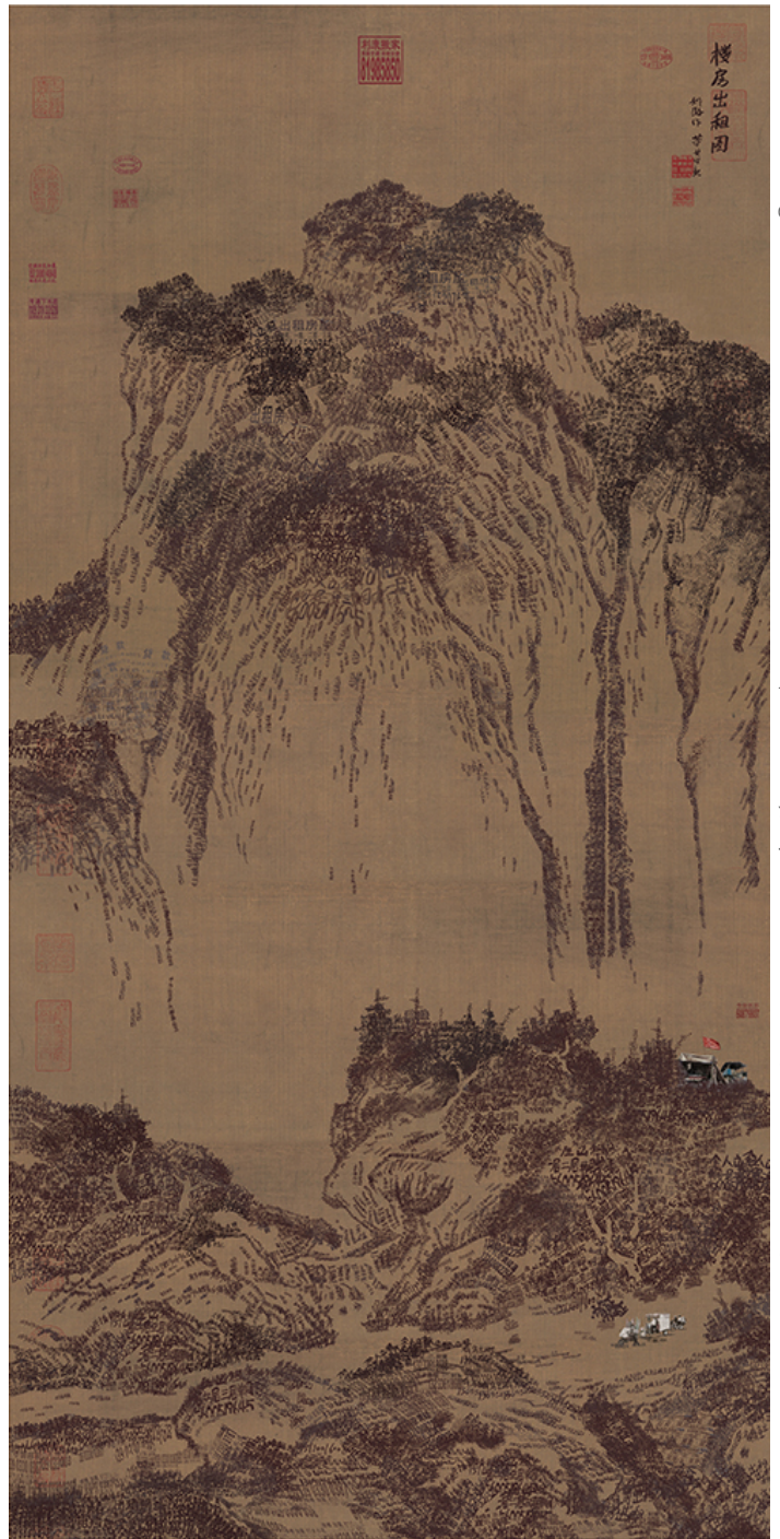
Traveller's among Mountains and Streams 溪山行旅图(新预览版), Epson Ultra Giclee, 250 x 110 cm, 2016

他的作品探讨了当下中国的环境剧变和现代化进程带来的后果，传达出现在与过去之间尖锐对比。驻足远观，画作仿佛是天人合一的中国古代山水画卷，而近看却发现艺术家意在揭示当下的社会问题。姚璐的作品不仅在全国各地展出，还远赴法国、意大利、美国、英国、澳大利亚和韩国参展。曾在2008年获得PARIS PHOTO 宝马大奖。