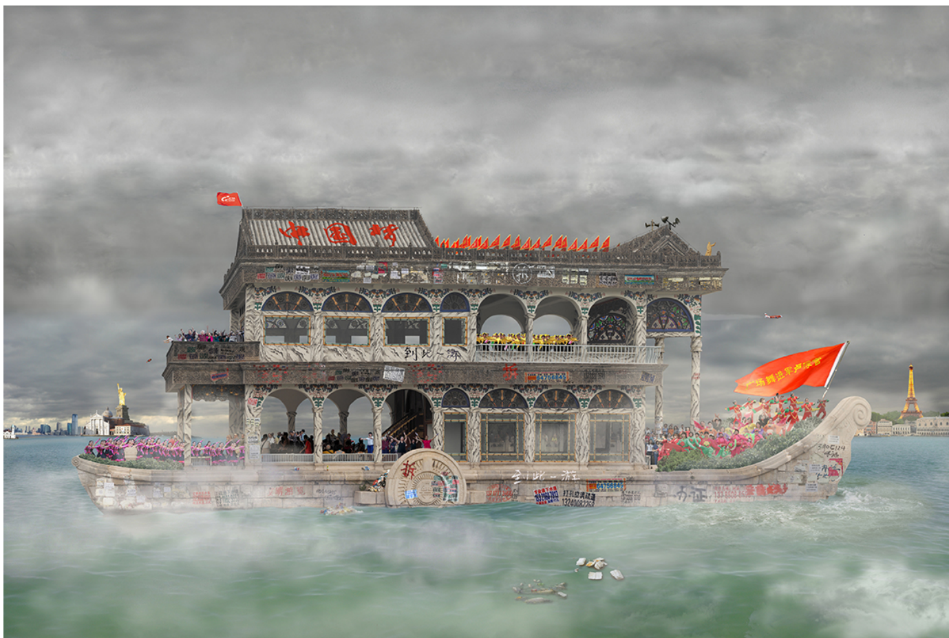
Seaside No. 2 海国图志之二, Epson Ultra Giclee, 100 x 150 cm, 2014