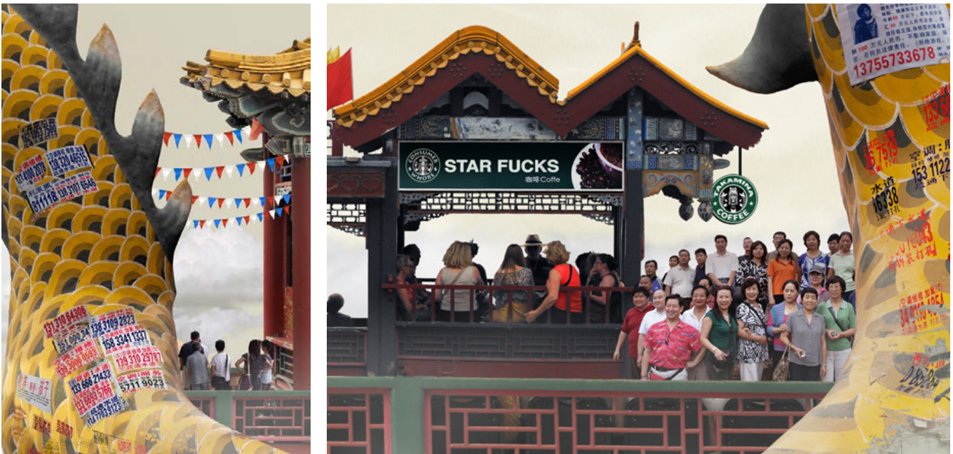
Seaside No. 1 海国图志之一, detail 局部