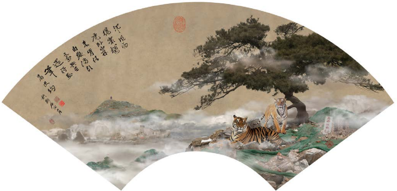
The Roaring Tigers in the Mist 云隐长啸图, C-Print, 113 x 60 cm, 2010

“In China’s present social situation of “developing”, we keep changing, replacing, destroying, while at the same time reconstructing, and revising, and we can often find cuts in the streets. All these are the inevitable results of a transition period as everything is moving forward and unsure. Of course it also involves opportunities, as you always have chances to change and make it perfect. The right and the wrong, protection and destruction are replacing, opposing, and complementing each other, forming our present