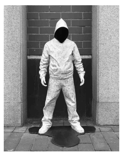
Huang Yulong 黄玉龙, Existence 存在, Bronze 铜, 2018