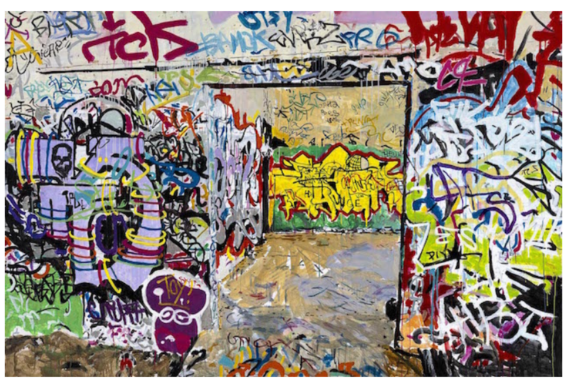
Chen Xuanrong 陈轩荣, G1.0.4.9, 140 x 210 cm, Acrylic on canvas, 布面丙烯, 2018