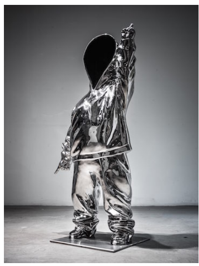
Huang Yulong 黄玉龙, Heaven and Earth 天地, Stainless Steel 不锈钢, 92 x 45 x 35 cm, 2018

Exhibition Duration: 28<sup>th</sup> October – 30<sup>th</sup> December 2018